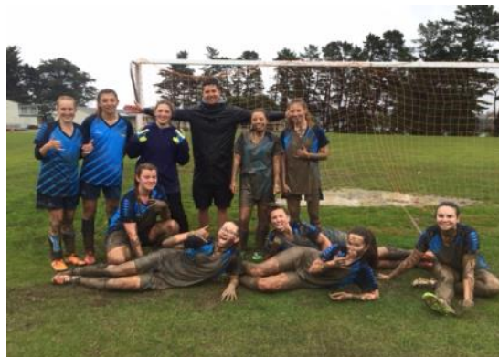
WHS 2nd XI Girls after a great win against Mt Roskill Grammar School