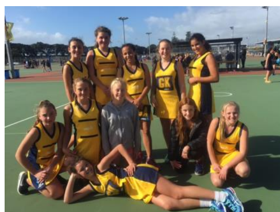
Our Year 8 Netball Team placed 8th out of 18 teams at the Y8 CZ Netball Tournament