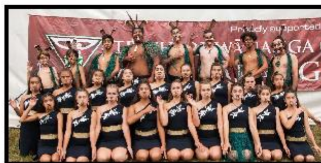
Waiheke High School Piringakau Kapa Haka