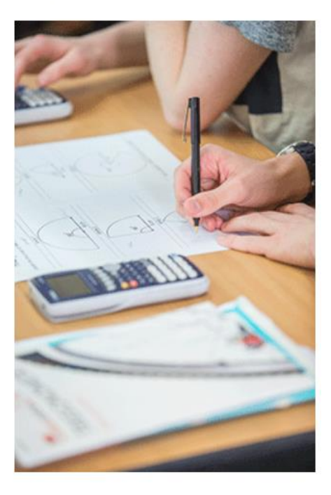
Learn what you need to know about external exams here.

Past paper exams and other resources are available here.